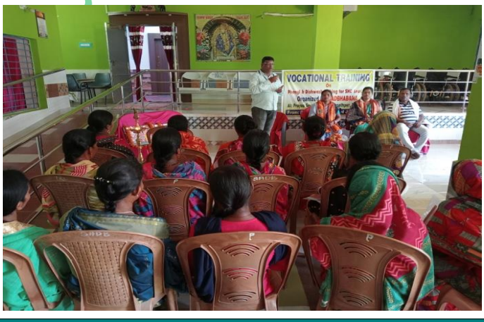
Resource Person. The praxis of the training was 10% on theory and 90 % on practical. Practical demonstrations on preparation of phenyl and Dishwash was held by the Resource Persons. Thereafter the Resource person shared their experience of marketing of the Products.